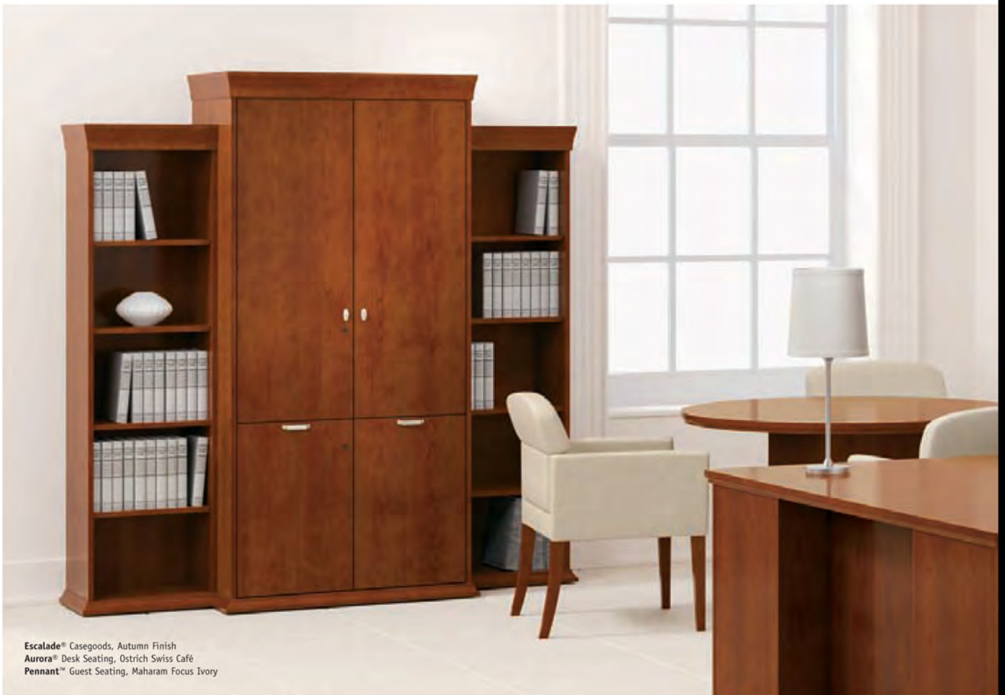
Escalade® Caseloads, Autumn Finish Aurora® Desk Seating, Ostrich Swiss Café Pennant™ Guest Seating, Maharam Focus Ivory

With an emphasis on professionalism and exquisite style, Escalade qualities are designed to set you apart from the rest.