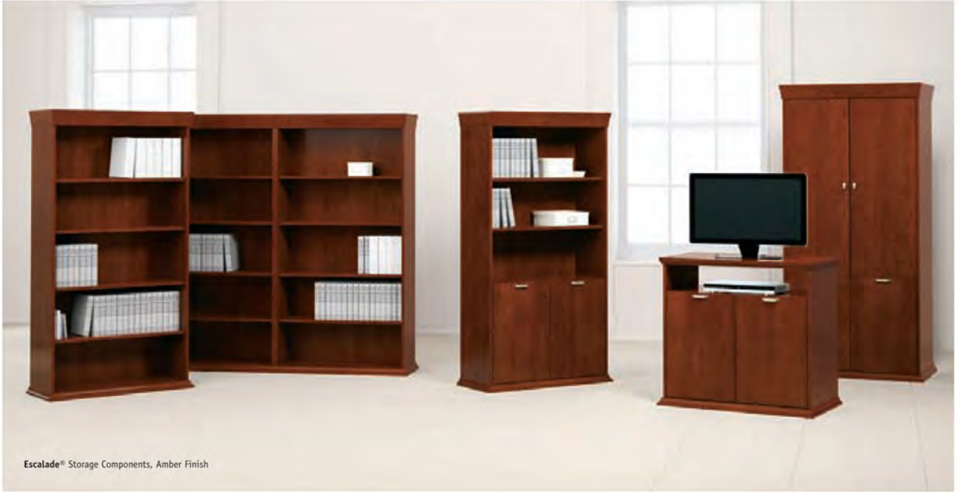
Escalade® Storage Components, Amber Finish