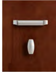
Drawer/Door Pull Satin Nickel