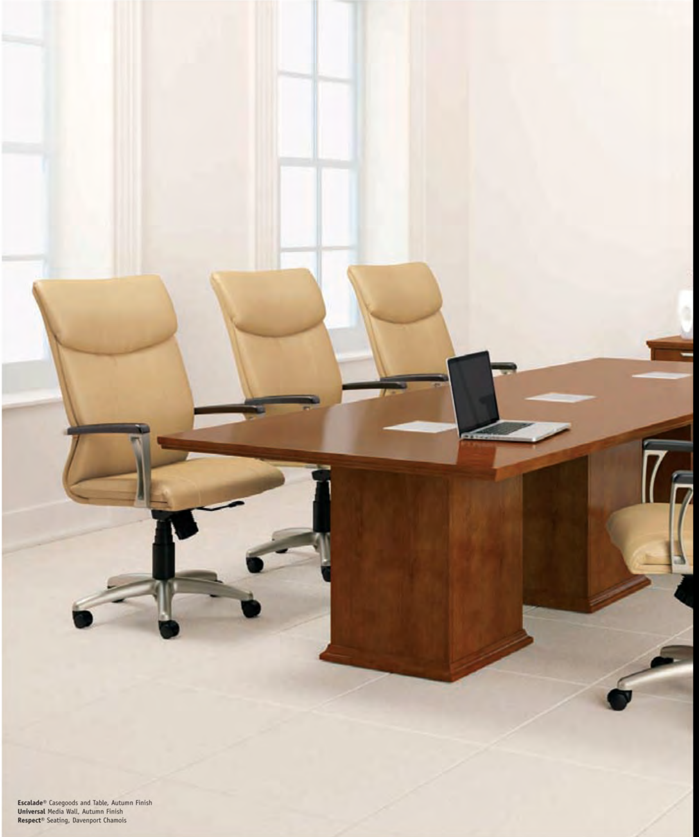
Escalade® Caseloads and Table, Autumn Finish Universal Media Wall, Autumn Finish Respect® Seating, Davenport Chamois