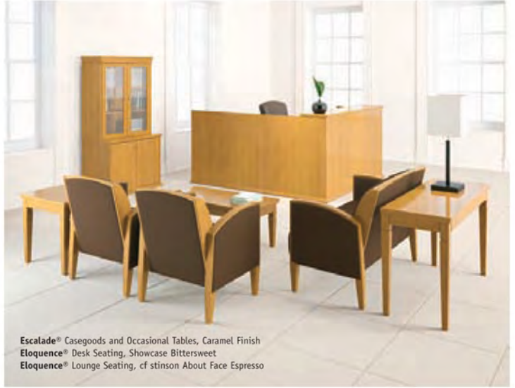
Escalade® Casegoods and Occasional Tables, Caramel Finish Eloquence® Desk Seating, Showcase Bittersweet Eloquence® Lounge Seating, cf stinson About Face Espresso