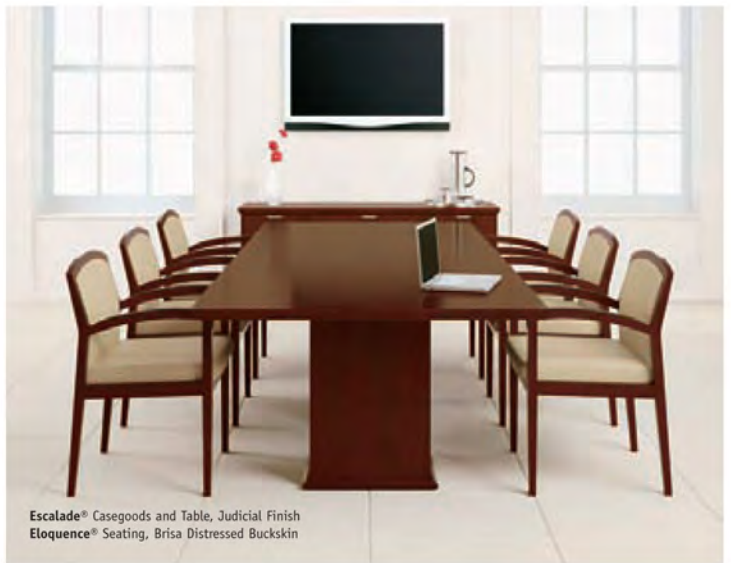
Escalade® Casegoods and Table, Judicial Finish Eloquence® Seating, Brisa Distressed Buckskin