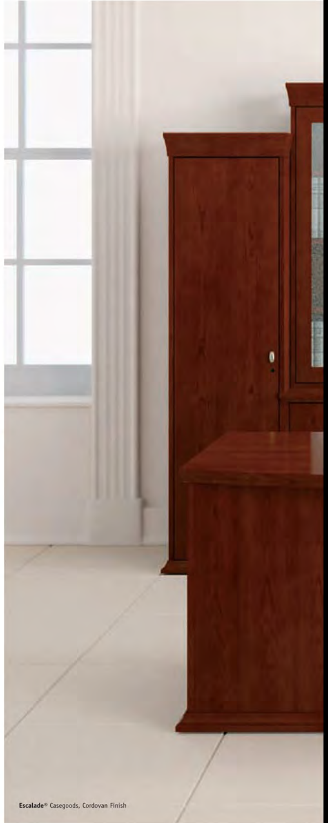
Escalade® Casegoods, Cordovan Finish