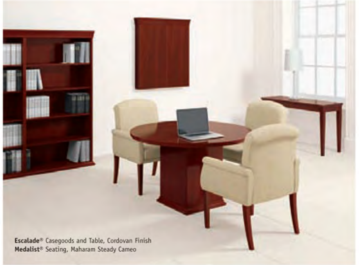
Escalade® Casegoods and Table, Cordovan Finish Medalist® Seating, Maharam Steady Cameo