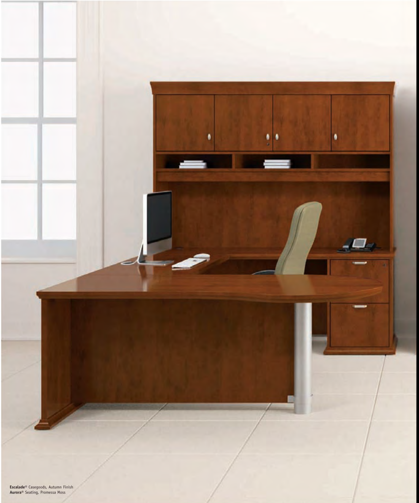
Escalade® Casegoods, Autumn Finish Aurora® Seating, Promessa Moss