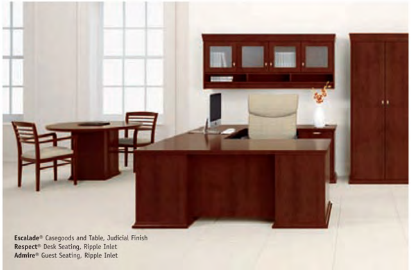
Escalade® Caseloads and Table, Judicial Finish Respect® Desk Seating, Ripple Inlet Admire® Guest Seating, Ripple Inlet