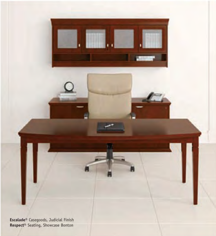
Escalade® Casegoods, Judicial Finish Respect® Seating, Showcase Bonton