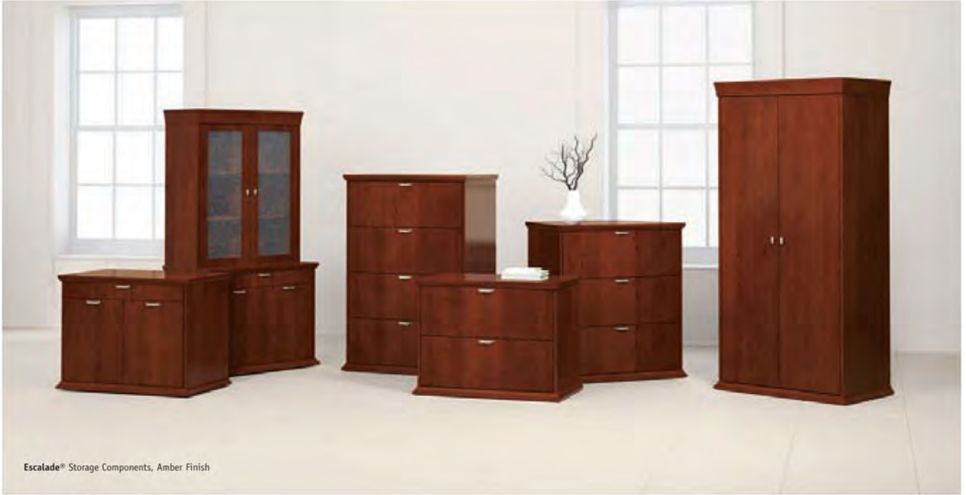
Escalade® Storage Components, Amber Finish