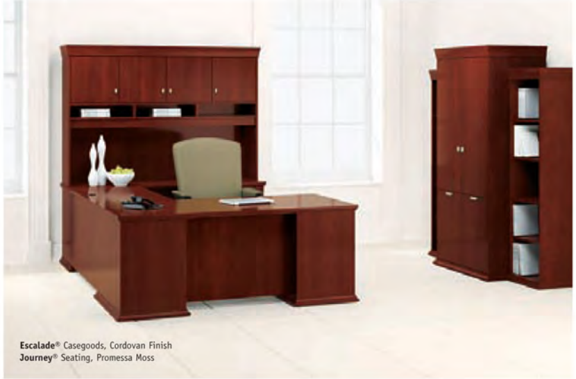
Escalade® Caseloads, Cordovan Finish Journey® Seating, Promessa Moss