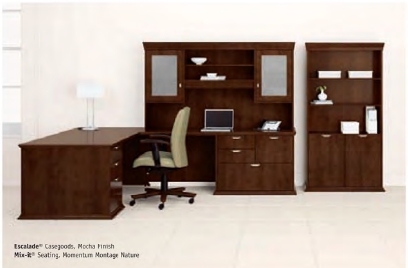
Escalade® Caseloads, Mocha Finish Mix-it® Seating, Momentum Montage Nature