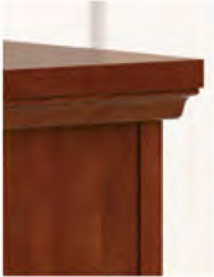
Mitered Rim Profile